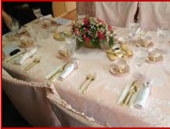
Lovely place settings done by the Anniversary Committee