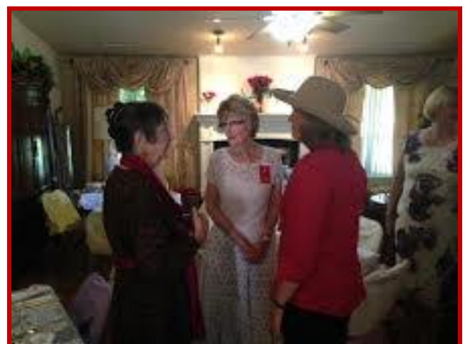
Eta Zeta's 50th Anniversary Tea