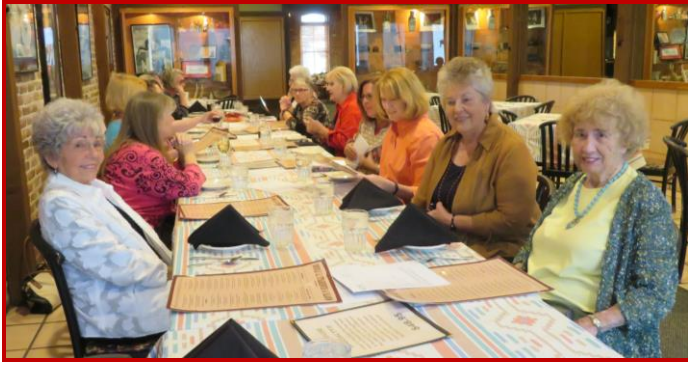
Celebrating Lily's Legacy